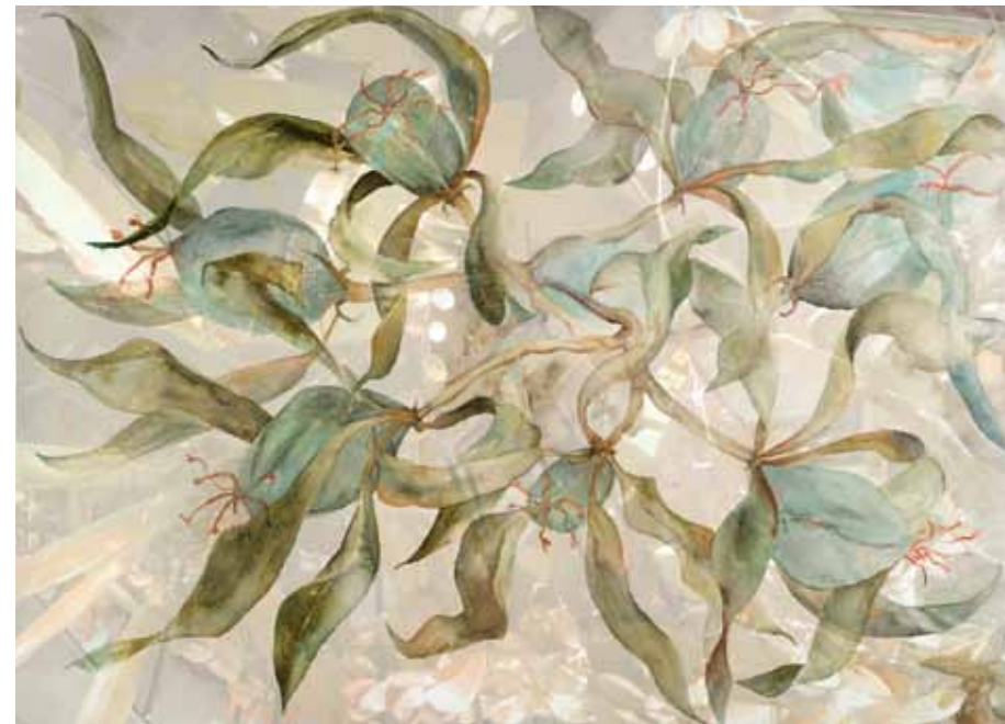
PAPAYA NUEVO , 2011, WATERCOLOR & ARCHIVAL INK JET ON PAPER, 47 × 32 INCHES

For the artist visually re-presenting the natural world through her art is a means of