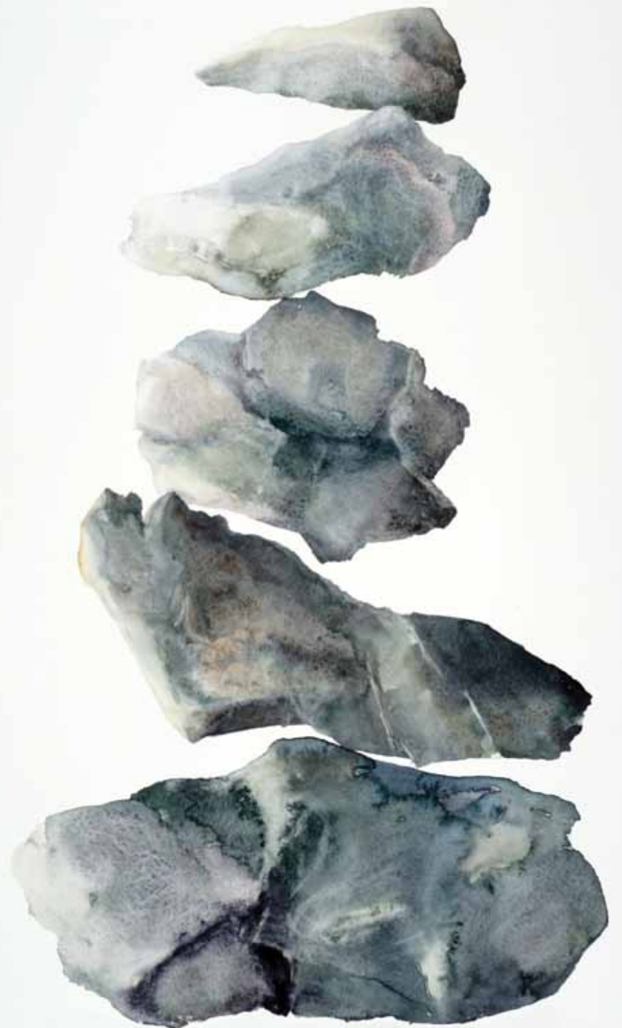
BALANCE OF HERMA , 2011, WATERCOLOR ON PAPER, 30 × 22 INCHES (Right)