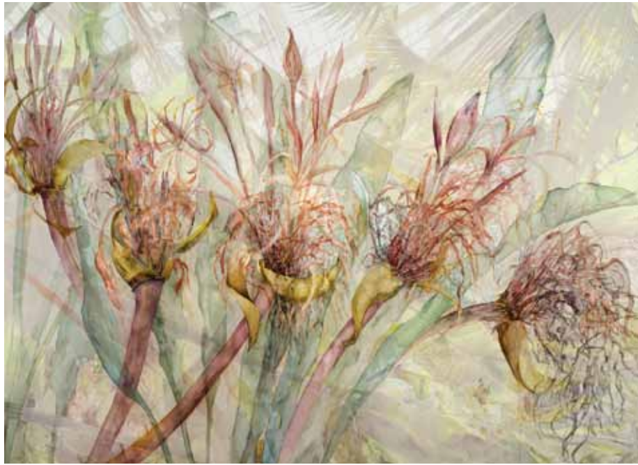
TOXIC BEAUTY, QUEEN EMMA , 2011, WATERCOLOR & ARCHIVAL INK JET ON PAPER, 35 × 47 INCHES