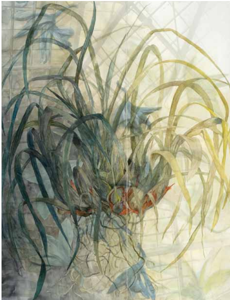
ORPHEUS' ORCHID , 2011, WATERCOLOR & ARCHIVAL INK JET ON PAPER, 47 × 36 INCHES (Two panels)